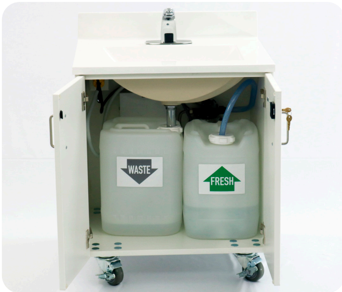
COLD / HEATED